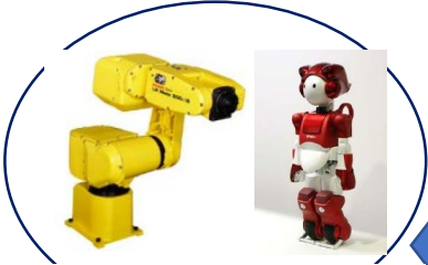
Industrial equipment and Robot